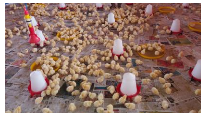
Chicks are in Comfort Zone: Eating, Drinking, playing & Making sound immediately after Release from Chicks Box