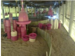
Final Disinfection with all Equipment inside